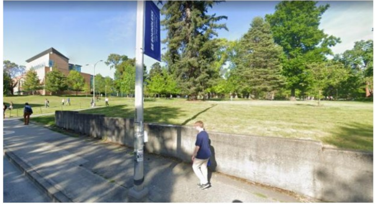
Serves those exiting on north end of the building

Lawn near Parrington across 15th Ave NE from Social Work Building north end.